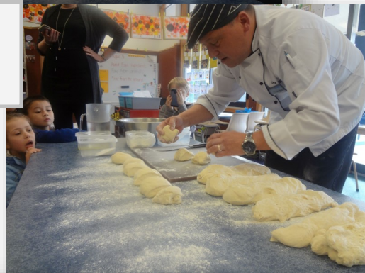
Each child rolls their own bread bun.