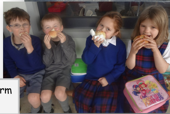
We enjoyed eating our warm bread bun for lunch.