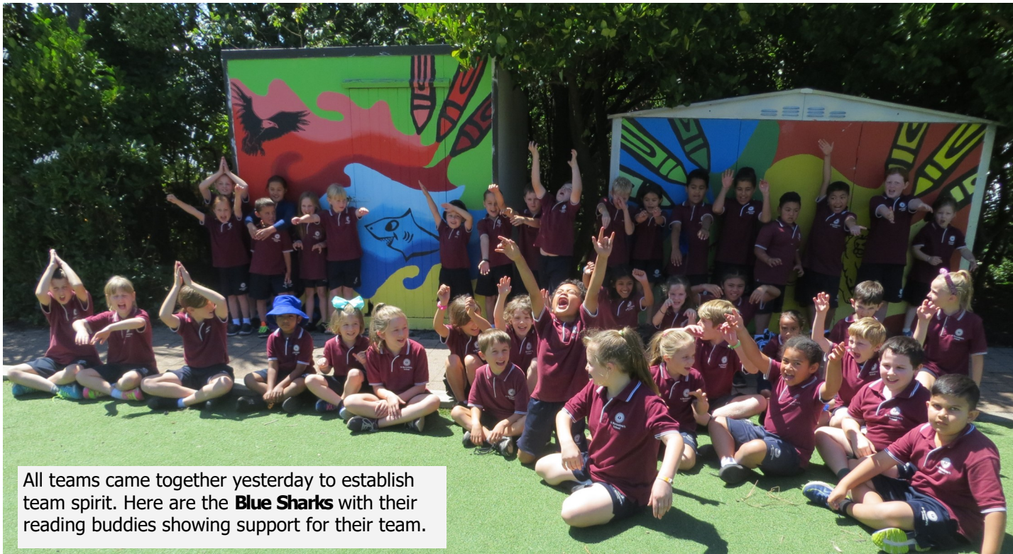
All teams came together yesterday to establish team spirit. Here are the Blue Sharks with their reading buddies showing support for their team.

Events take place from 9.40am till 12pm. It's one of those very special days on the school calendar. A chance for the children to show their athletic skills and participate in friendly rivalry against their school mates from other teams. All members of the school community are encouraged to come along and support the Blue Sharks, Red Eagles, Green Tigers and the Yellow Lions. At the end of the day we will hold a special assembly back at school at 2.30pm to announce the team results. We will be travelling by bus to and from the event. There is no cost to parents for the buses thanks to our wonderful Home and School Association which sponsor one school event each term. If the weather is poor the postponement day is Friday the 23rd of March. Full details and timetable in next week's newsletter.