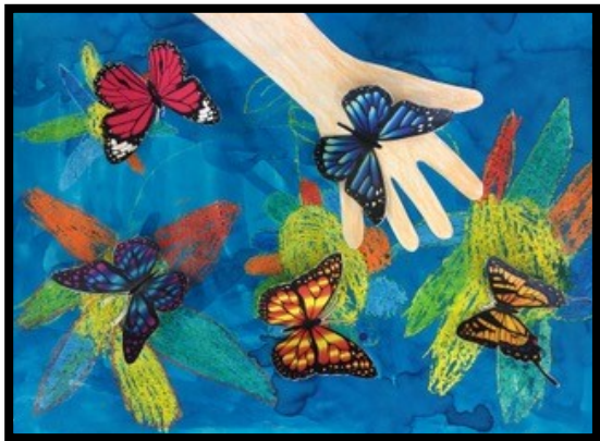
Butterfly art work by Room 6