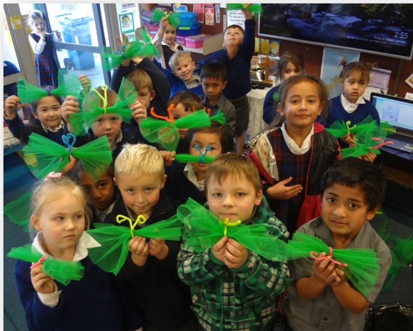
The year 1 children made butterflies to reinforce their alphabet work about the letter B.