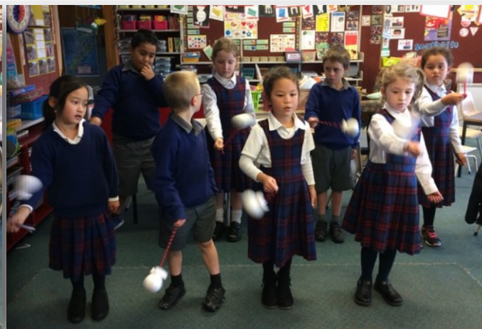
Room 7 have been learning E Rere Taku Poi over the past two weeks. We have just about perfected moving our poi up and down, and in and out, to the words and music.