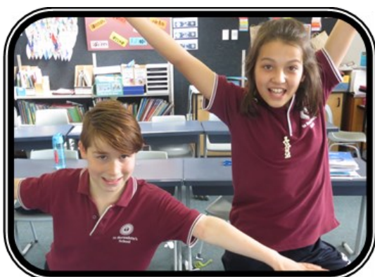
Dance a story