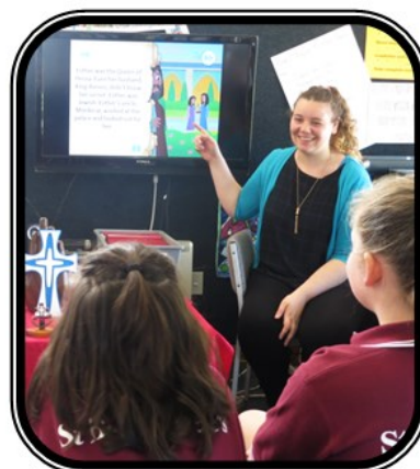
Show a story