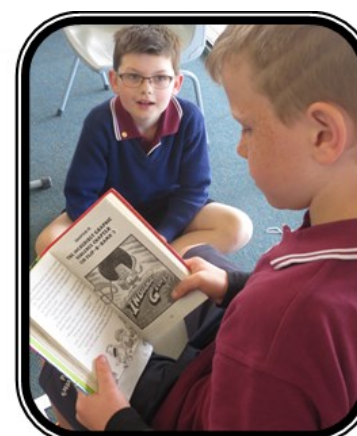
Listen to a story

Find out more: stbernadettes.school.nz Inquiry Learning