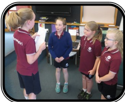
Read a story