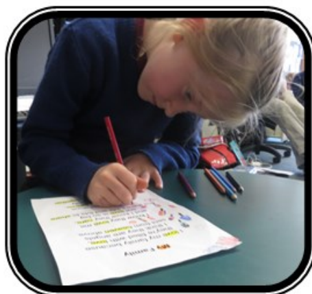
Revisit a story