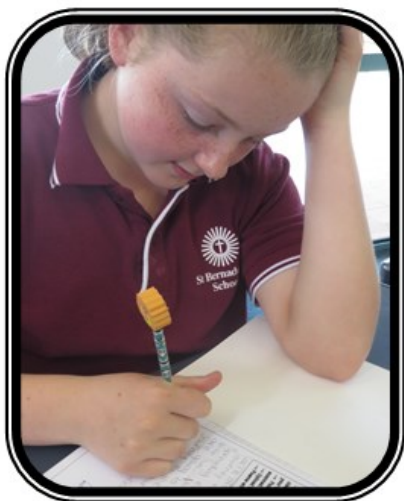
Write a story