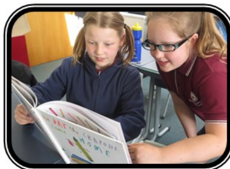
Share a story