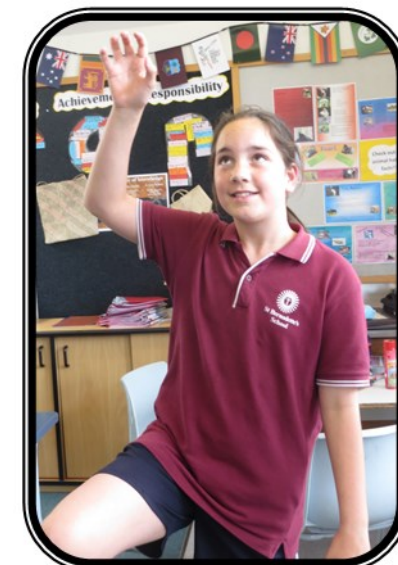
Mime a story