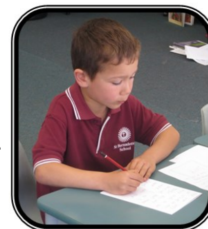
Plan a story