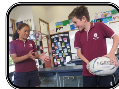
Act out a story